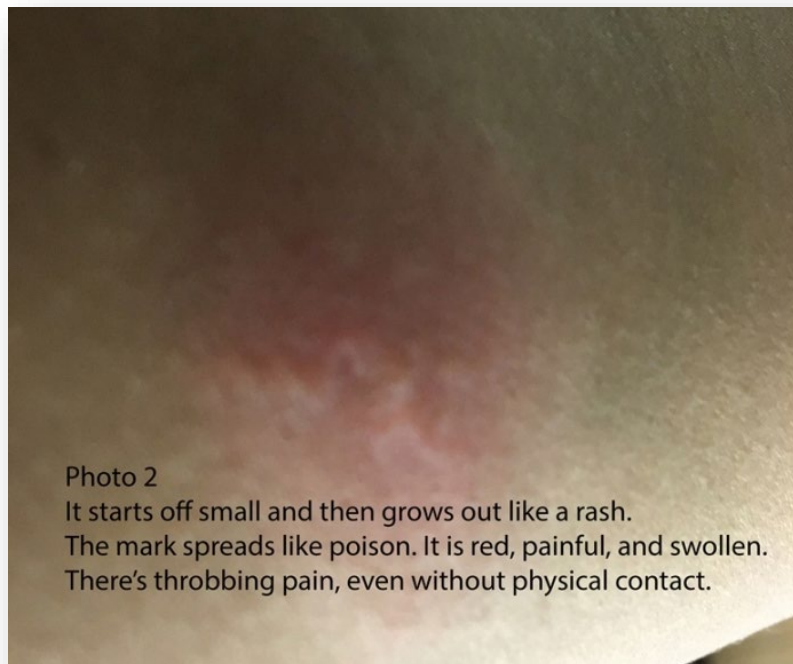
Photo 2 It starts off small and then grows out like a rash. The mark spreads like poison. It is red, painful, and swollen. There's throbbing pain, even without physical contact.