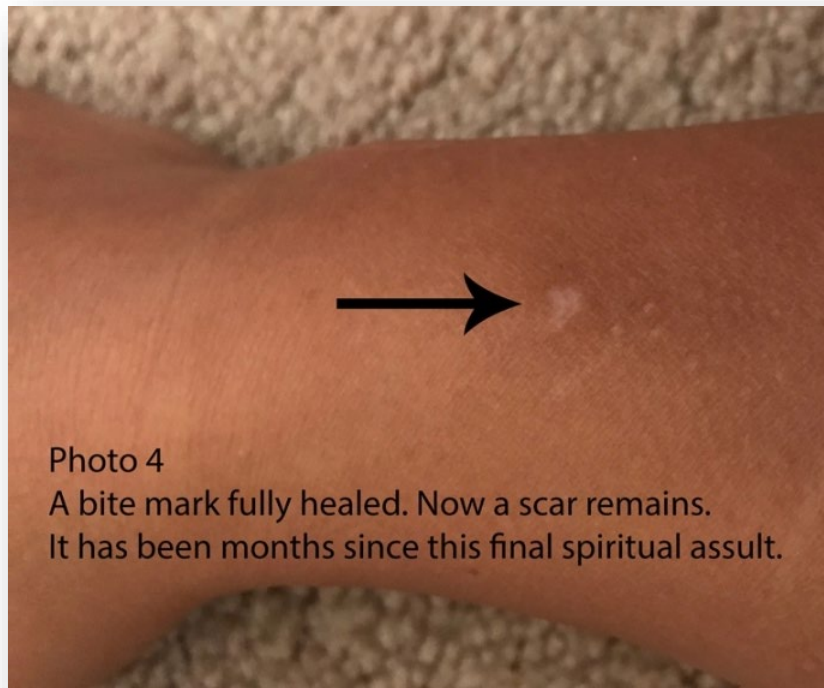
Photo 4 A bite mark fully healed. Now a scar remains. It has been months since this final spiritual assault.